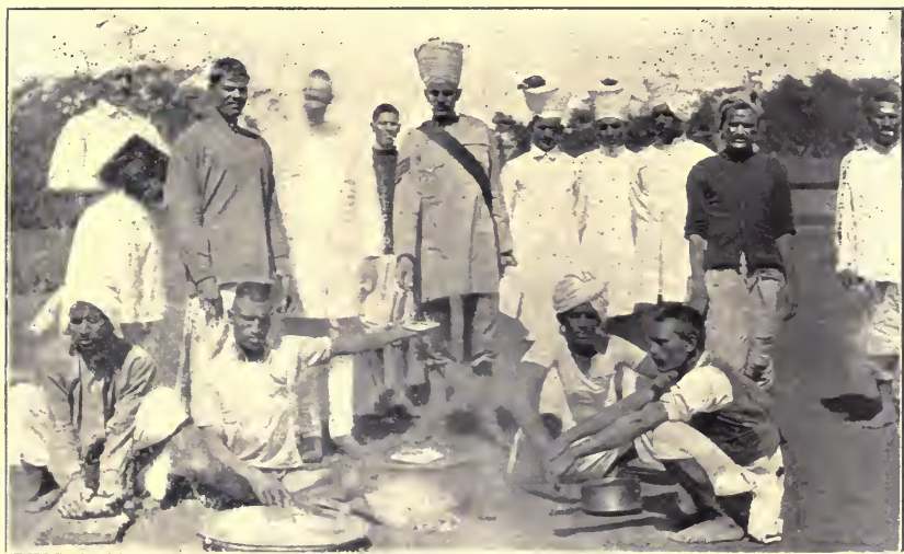
RAJPUT SEPOYS COOKING.